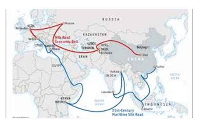
Belt Road Initiative

China's Belt and Road projects similarly leverage Chinese economic instruments for strategic ends. Originally announced by Xi in 2013, the program has been promoted by the Chinese government as a the "project of the century," as China's "Marshall Plan," and as a new "silk road." In historical quirk, the very term "Silk Road" was originally devised in Imperial Germany and shaped Berlin's own continental ambitions.